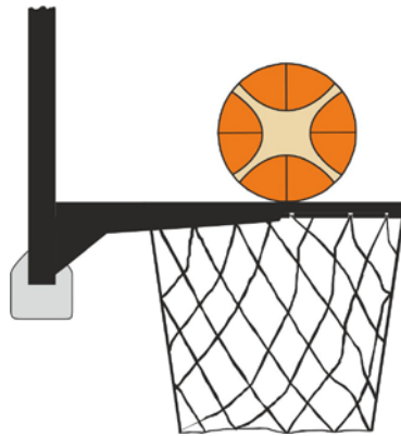
Diagram 2 Ball in contact with the ring

31-15 Statement. Interference is committed by a defensive or offensive player during a shot for a field goal when a player touches the basket or the backboard while the ball is in contact with the ring and still has a possibility to enter the basket.