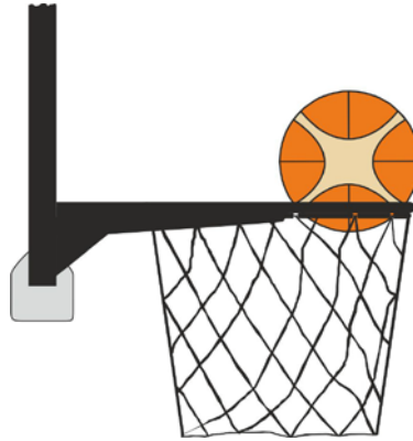
Diagram 3 Ball is within the basket

31-20 Statement. It is an interference violation if a defensive player touches the ball while the ball is within the basket.